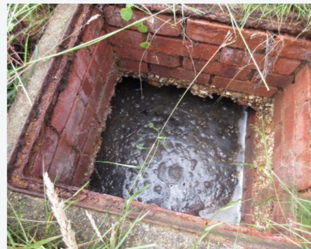
The Blackwater storage tank with the access cover removed showing the typical contents the sensor was tested in.

The testing is ongoing to cover a 12 month period.