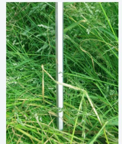
After 6 months it can be seen that the sensor probe was clean and free from scum/debris build-up.