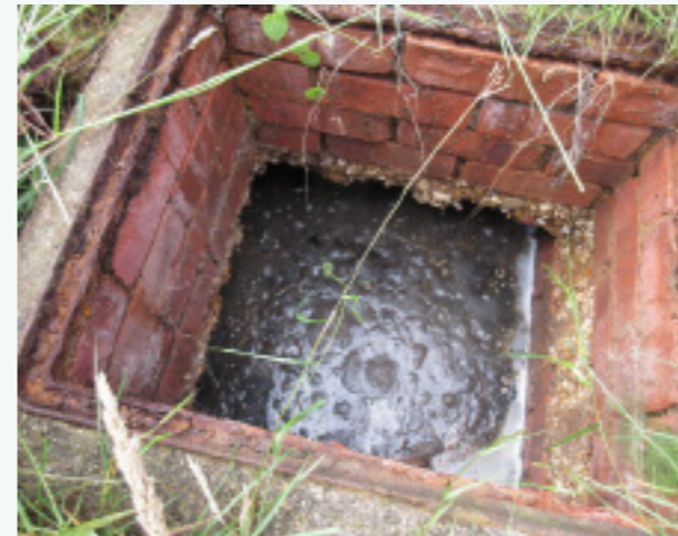
The Blackwater storage tank with the access cover removed showing the typical contents the sensor was tested in.

The testing is ongoing to cover a 24 month period.