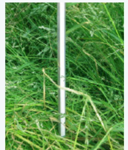
After 6 months it can be seen that the sensor probe was clean and free from scum/debris build-up.