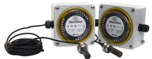
Option for WearDetect sensors with local display