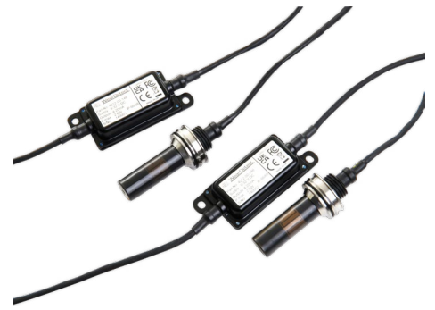
Kit contains two WearDetect sensors

Make the move to continuous wear detection with this simple, easy to use kit.